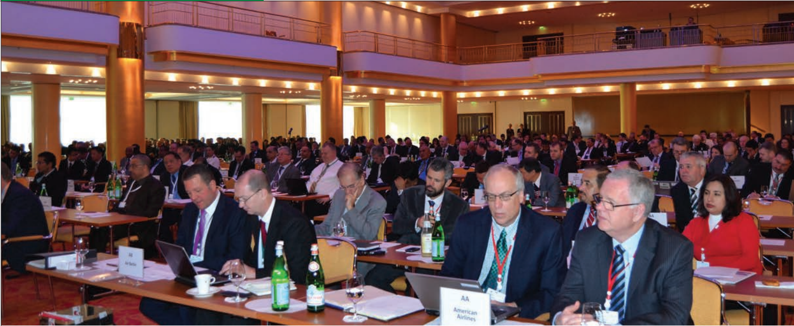
More than 400 airline and manufacturers' delegates attended the latest IATP conference in Hamburg.